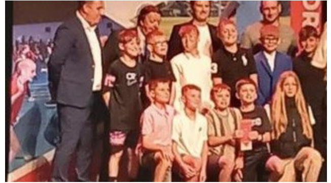
Our Year 5/6 Mixed team

We were delighted to be chosen in three categories for teams of the year at the most recent Get Ahead Awards. Firstly we won the Year 5/6 Mixed team of the year for our football team, we also won the girls team of the year for our girls football team and finally inclusion team of the year for our Boccia team. This is the first year of these awards and we were delighted to be nominated let alone win. Well done to all of our teams this year.