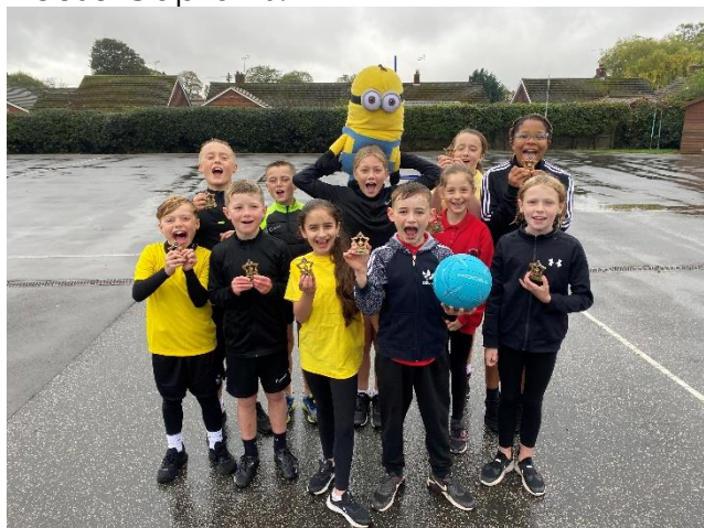
The Winning Newton Year 5/6 team

when they were in Year 5. Either through being an excellent sports leader, helping children to read or simply by following all of the schools values each and every day. They have already made an impact with new Mascots, posters of their houses, keeping the jars in classes topped up as well as counting all of the house point tokens that are earned in school each week. The children have also cleared out the outdoor sports cupboard and are ensuring that all of the netballs, footballs etc are being blown up on a weekly basis so they can be used for lessons. Indeed they have made an excellent start to their time as House Captains.