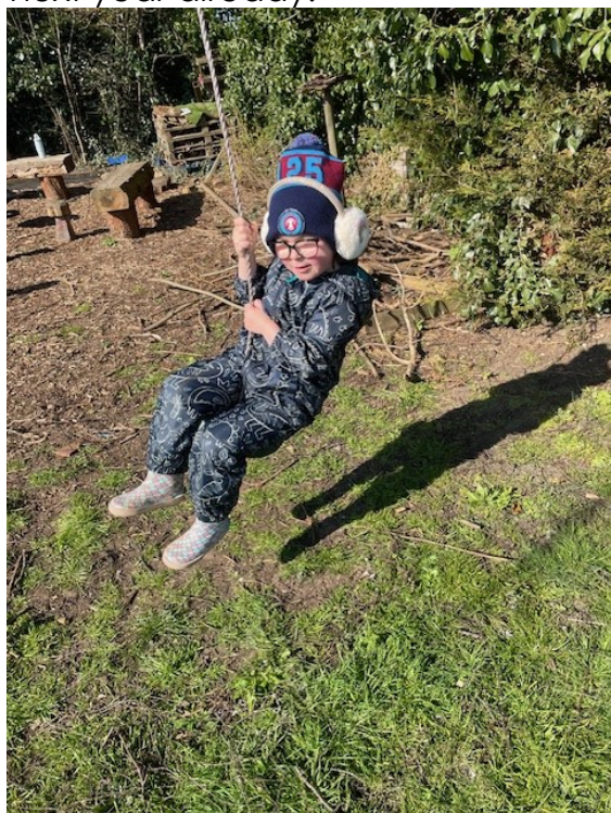
Time for a swing!

and we are very much looking forward to next year already.